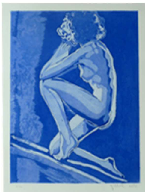
Nude I, 1996

Original Hand Signed and Numbered Etching with Aquatint 65.2 x 50 cm / 25.6 x 19.6 in £800