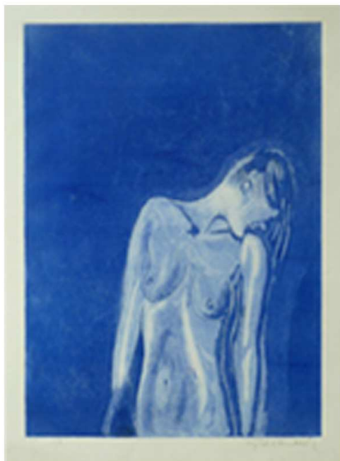
Woman with her Head Leaning, 1996

Original Hand Signed and Numbered Etching with Aquatint 65.2 x 50 cm / 25.6 x 19.6 in £800