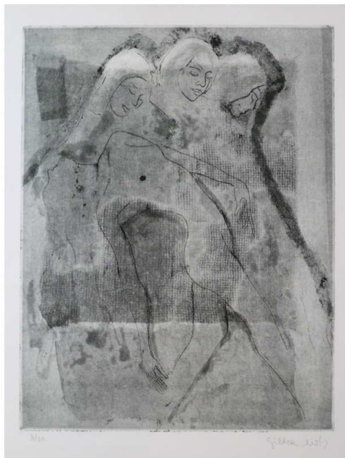
Three Dancers, 1996 Original Hand Signed and Numbered Etching with Aquatint 65 x 50 cm / 25.4 x 19.6 in £800