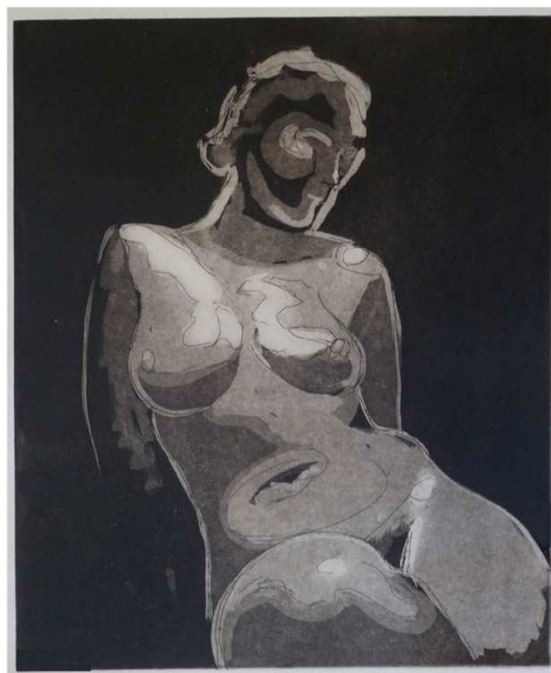
Woman in Black, 1996 Original Hand Signed and Numbered Etching with Aquatint 65 x 50 cm / 25.4 x 19.6 in £1,000